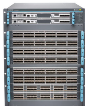
PTX10008 Packet Transport Router