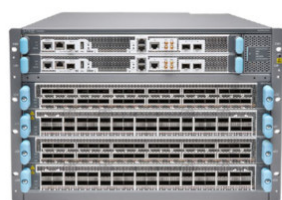
PTX10004 Packet Transport Router