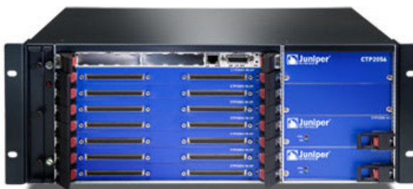
CTP2056 Circuit to Packet Platform