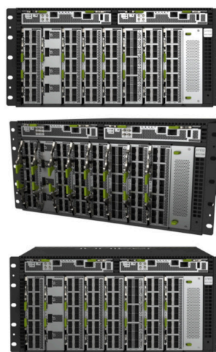
Figure 2. Juniper ACX7509—engineered for the IP service fabric of a Juniper Cloud Metro