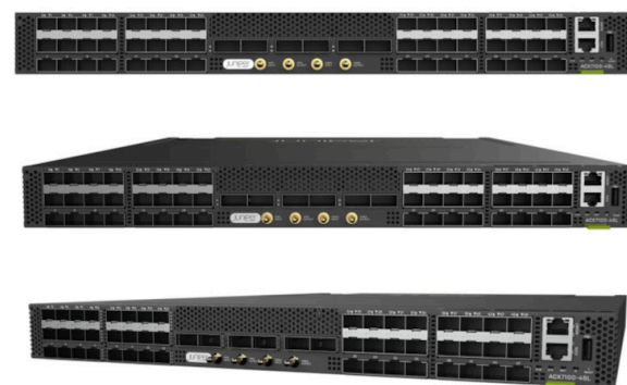
Figure 3. Juniper ACX7100-48L—engineered for the IP service fabric of a Juniper Cloud Metro